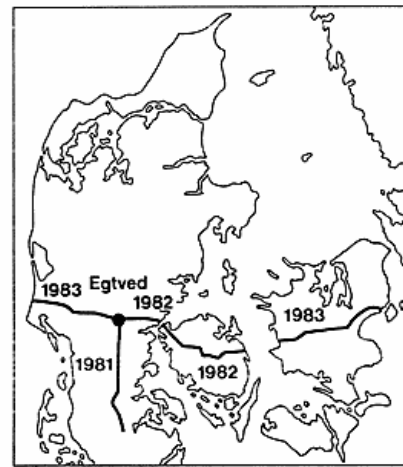
Fig. 1. Main gas pipeline system and the year of construction. Fig. 1. Dansk Olie og Naturgas' hovedtransmissionsledninger gennem landet med angivelse af anlægsår.

The computerized data have been widely used in agricultural planning. For this purpose transfer models have been elaborated to calculate e.g. the actual and potential drainage requirements within larger regions and the amount of nitrate leached from the farmland to the water-