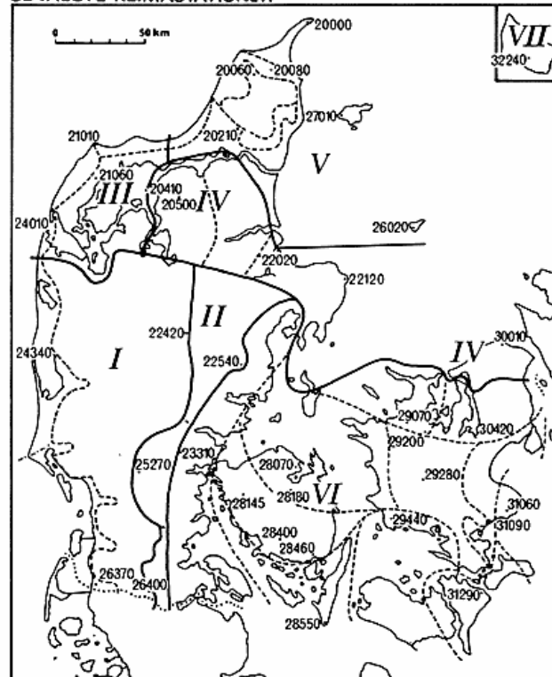
Fig. 2. Meteorological stations selected.

landscape elements which have many features in common. Pedologically: luvisols. Climatologically the region comprises two natural subregions, the Storebælt-region being special because of its lower rate of precipitation and consequent negative water balance. The growing season is everywhere above 200 days. The region can be divided into the following subregions: